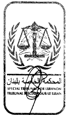
Judge Micheline Braidy