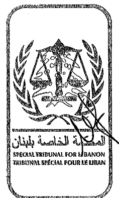
Judge Antonio Cassese Presiding Judge

Dated this fourth day of February 2011, Leidschendam, The Netherlands