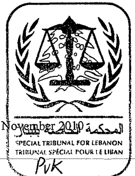
Judge Antonio Cassese President