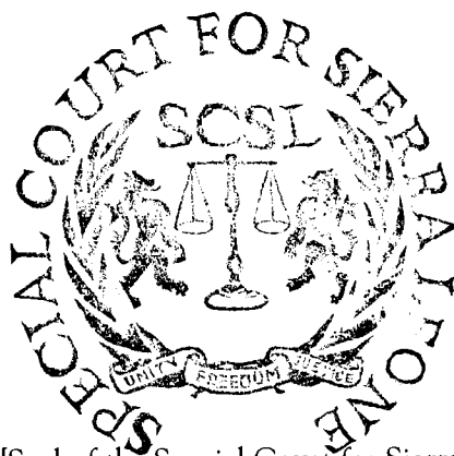
[Seal of the Special Court for Sierra Leone]