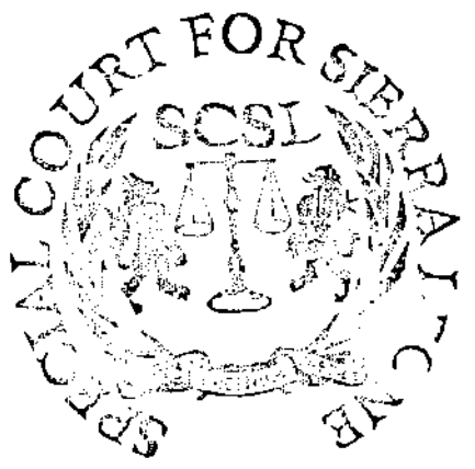
Seal of the Special Court for Sierra Leone

Judge Benjamin Mutanga Itoe The Trial Chamber