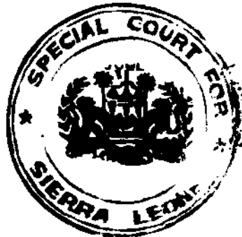
Seal of the Special Court