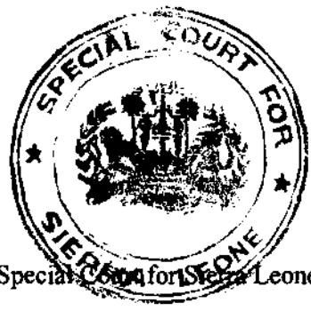
Seal of the Special Court for Sierra Leone