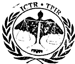
[Seal of the Tribunal]

Done this second day of March 2012, at The Hague, The Netherlands.