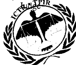
[Seal of the Tribunal]