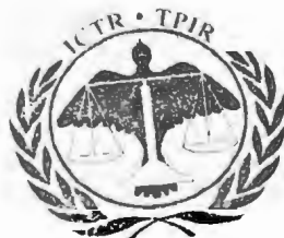
[Seal of the Tribunal]

Done this 10 th day of February 2011 At The Hague, The Netherlands.