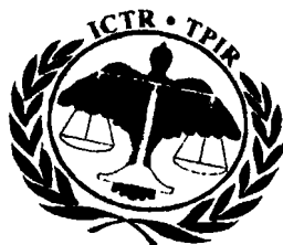
[Seal of the Tribunal]

Done this 11th day of June 2010, At The Hague, The Netherlands.