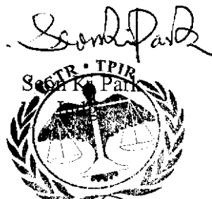
[Seal of the Tribunal]