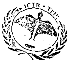
[Seal of the International Tribunal]

Done this sixteenth day of February 2010 at The Hague The Netherlands