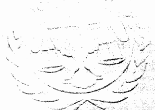
Seal of the Tribunal