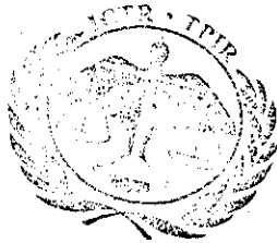
[Seal of the Tribunal]