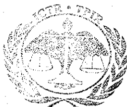
[Seal of the Tribunal]

Dated this eighteenth day of December 1998 At The Hague, The Netherlands.