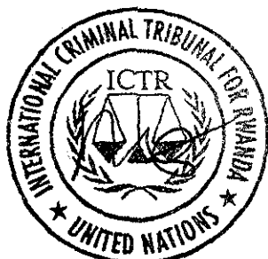
(Seal of the Tribunal)