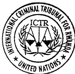
(Seal of the Tribunal)